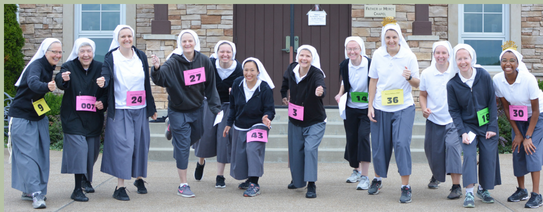
All the walking and running sisters posed at the starting line on race morning!

Each of us in our own families or communities has been tasked with this incredible charge: to BE the love, reconciliation, and forgiveness that we desire for our Church and world, right in our homes. Jesus told us that “whoever does the will of my Father is my brother, sister, and mother.” (Mt. 12:50) Each of us can bring Him to birth each day by the way that we live! As we’ve now begun to wade into 2021, my prayer and hope is that each of us can take what we’ve experienced last year – the wounds and also the joys – and let them be the ‘raw material’ that Christ can transform with His love into healing for the world.