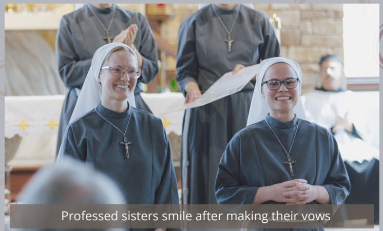
Professed sisters smile after making their vows