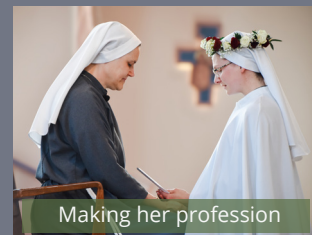
Making her profession