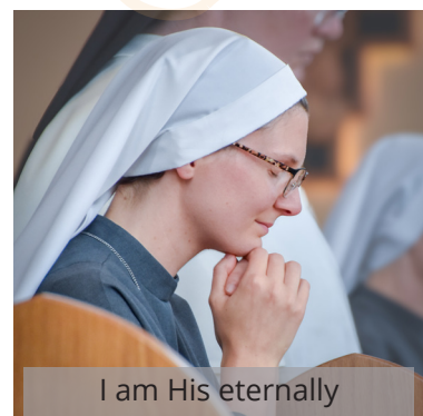
I am His eternally