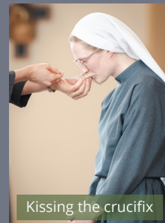
Kissing the crucifix